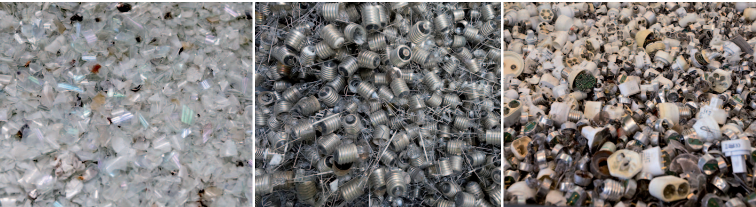
Output fractions: Glass, metal and plastic.